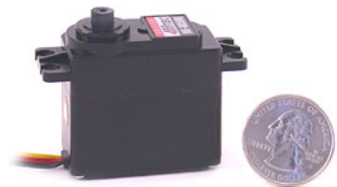
The HS-485HB is a standard size servo.

This servo can operate 180° when given a pulse signal ranging from 600usec to 2400usec. Since most R/C controllers cannot generate this wide of signal range, you will need to purchase our servo stretcher for 180° operation.