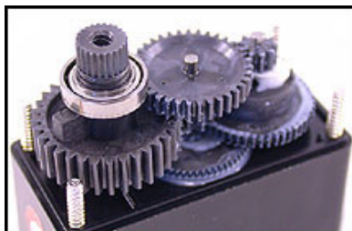
Ball Bearings & Karbonite™ gears